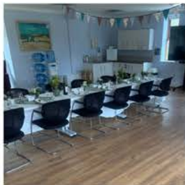
Spring Room Lunch Set Up