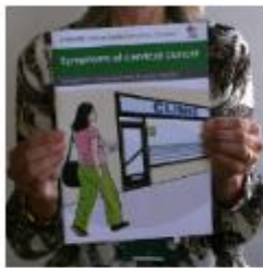
Symptoms of cervical cancer