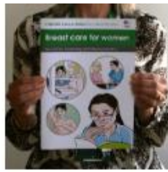
Breast care for women