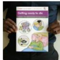
Getting ready to die