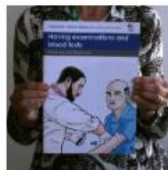
Having examinations and blood tests