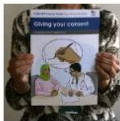
Giving your consent