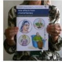
Side effects from chemotherapy