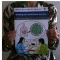
Finding out you have cancer