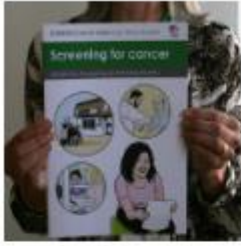
Screening for cancer