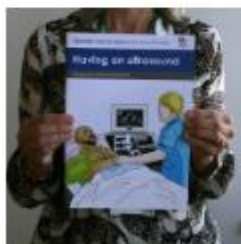
Having an ultrasound