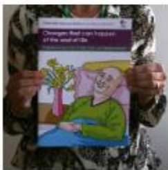
Changes that can happen at the end of life