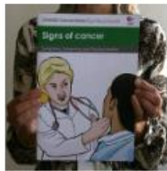
Signs of cancer