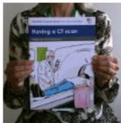
Having a CT scan