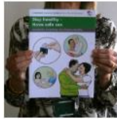
Stay healthy - Have safe sex