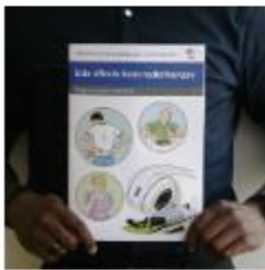
Side effects from radiotherapy