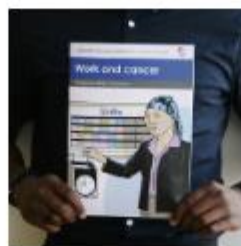
Work and cancer