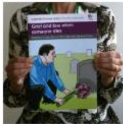
Grief and loss when someone dies