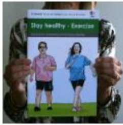
Stay healthy - Exercise