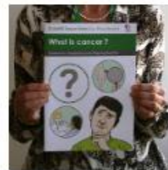
What is cancer?