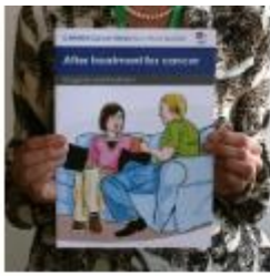
After treatment for cancer