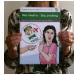
Stay healthy - Stop smoking