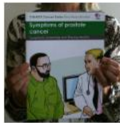
Symptoms of prostate cancer