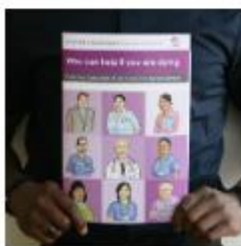
Who can help if you are dying