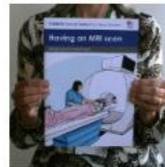
Having an MRI scan