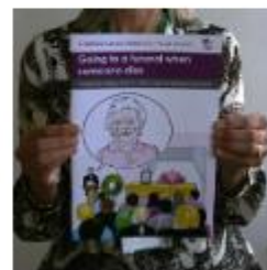
Going to a funeral when someone dies