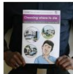
Choosing where to die