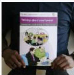
Thinking about your funeral