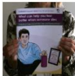
What can help you feel better when someone dies