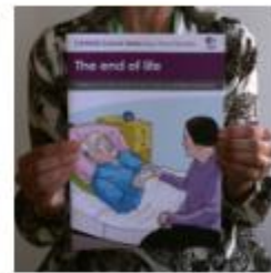
The end of life