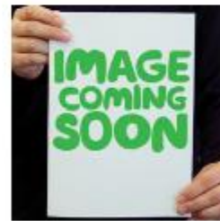
Signs of cancer - Erratum slip