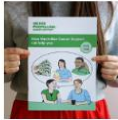
How Macmillan Cancer Support can help you