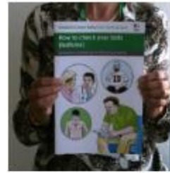
How to check your balls (testicles)