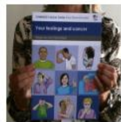
Your feelings and cancer