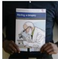
Having a biopsy