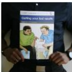
Getting your test results